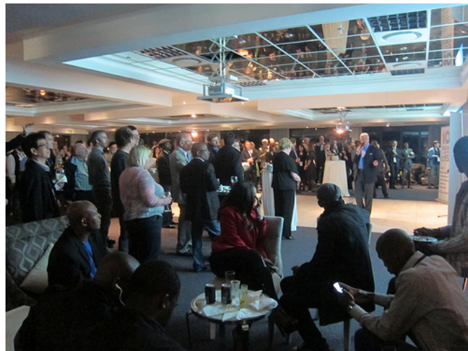
Picture 1 - ccNSO 10th Anniversary Cocktail Reception